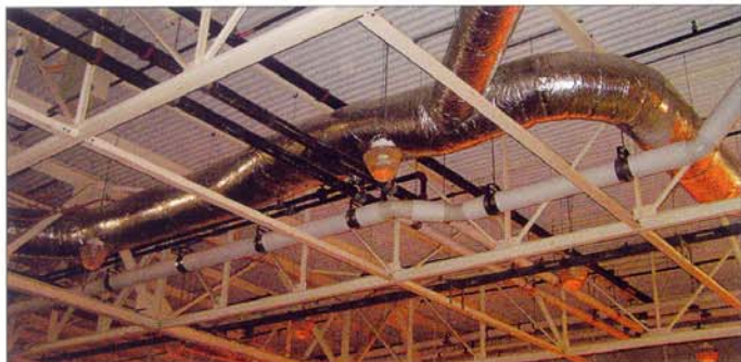
▲ Tight. Trimming on site is one thing, pre-fab to perfection is another.

design savings or schedule efficiencies were shared among the team. “We had three weeks of value-engineering sessions with architectural, mechanical, electrical and structural,” Ghafari’s Neville says. “We developed $5.5 million in proposed savings, most in ductwork and mechanical, and electrical...We were throwing everything down that could be eliminated.”