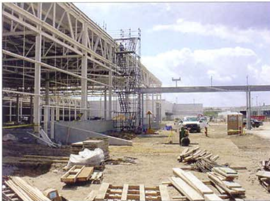
▲ V6. Comprehensive 3-D modeling cuts clutter and activity on site. Parts arrive cut to fit. No trash, no dumpsters.

What is working out well are design-build teams that are saving money and time and accomplishing the projects with