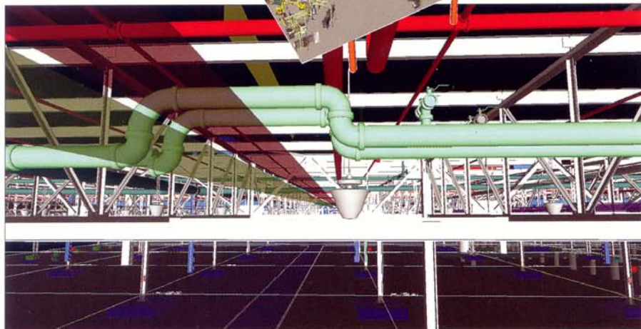
▲ No-Fly Zone. Facilities owns the space a foot above the top chord, production owns the floor.

subs were pouring their designs into the model. On Fridays they would pass their work to Emdanat who would integrate it over the weekend and run the collision detection routines. On Monday they would meet as a team to view the results.