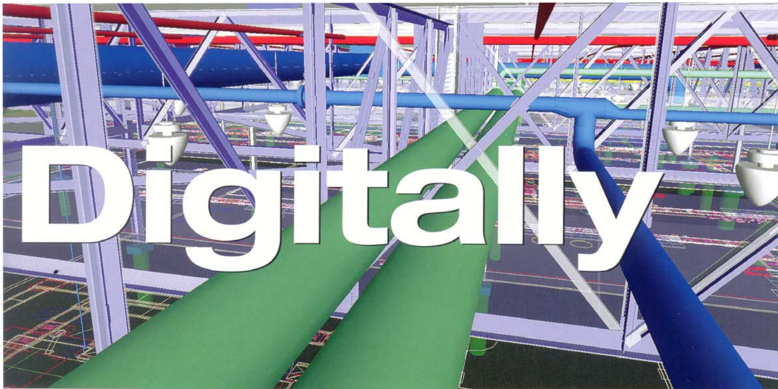
▲ Just Talk. Clash detection flagged issue when detailer flipped diagonal on last bay of truss.

the offsite fabrication and just-in-time delivery techniques of lean construction. They are each enabled by a commitment to build from comprehensive 3-D models that not only define facility geometry but have been refined by a team with fully incorporated structural, mechanical and electrical details.